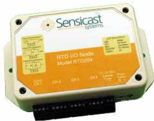
Figure 3. RTD204

Especially temperature and humidity of the air is a major factor in the development of the micro climate. The battery powered nodes are equipped with sensors for registering the air temperature and relative humidity and the soil temperature (Fig. 3). Each node is able to transmit/receive packets to other nodes inside a well defined transmission range. A single node transmit the temperature and relative humidity every minute.